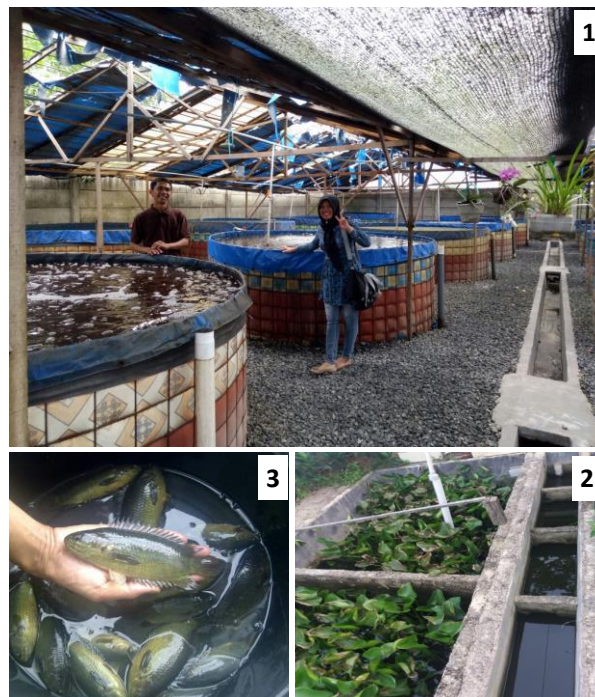
Fig.2: De' Papuyu Farm's facilities: 1. Typical culture pond, 2. Recycle pond, 3. Climbing perch

1. Culture pond area, 2. Recycle ponds, 3. Security house/warehouse, 4. Hall, 5. Park area, 6. Space area